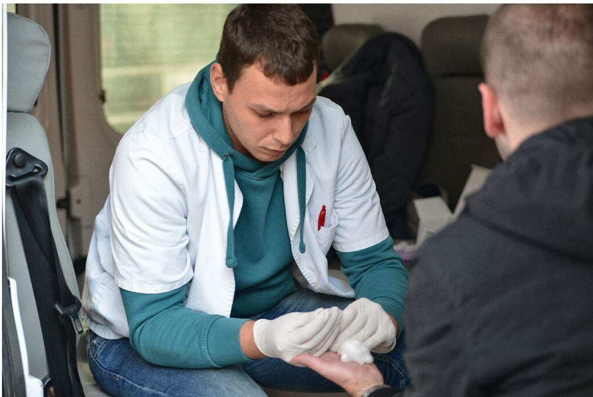
Figure 2. testing in a mobile unit.