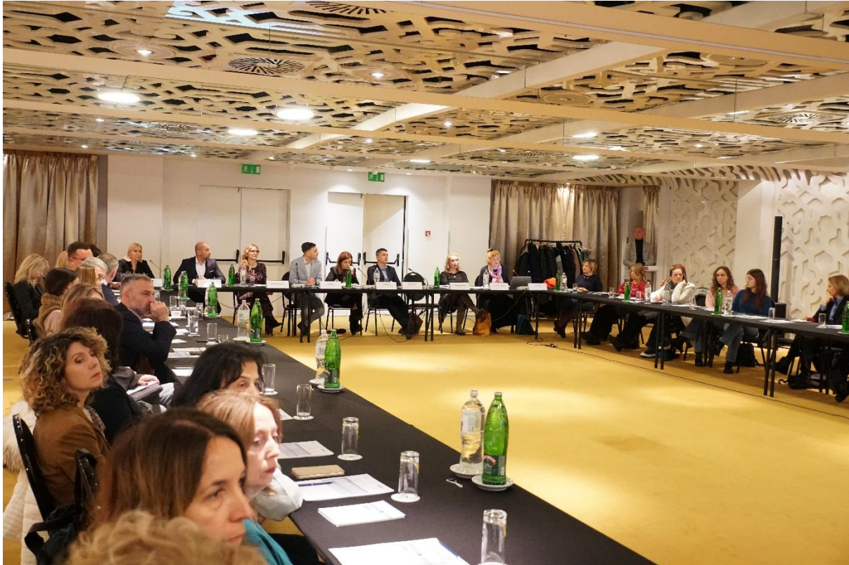
Слика 3. завршна конференција, представљање резултата истраживања.