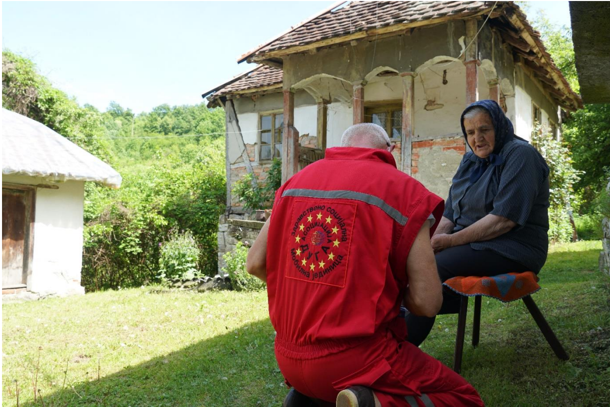
Figure 1. visit of the Association RAINBOW field team to client.